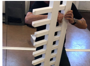
Step 2: Place pickets into mid-rail.