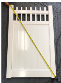
Step 6: Measure to make sure the gate is square.