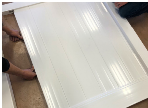
Step 4: Put U-Channel on first picket and slide into mid and bottom rail. Slide the rest of the pickets in and put the other U-Channel on the last picket.