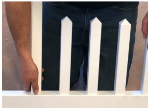
Step 1: Place pickets into top rail.