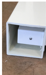
Step 7: Screw top and bottom rail into gate pockets.