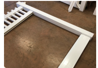
Step 3: Put top, mid-rail, and bottom rail into one post.