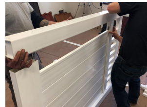
Step 5: Put top, mid-rail, and bottom rail into other post.