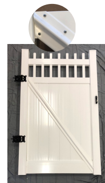
Step 8: Cut cross bar to desired length & make sure it's attached at the top of the hinge side. Step 9: Install Hinges and Latch per directions in hardware package. (Sold Separately)